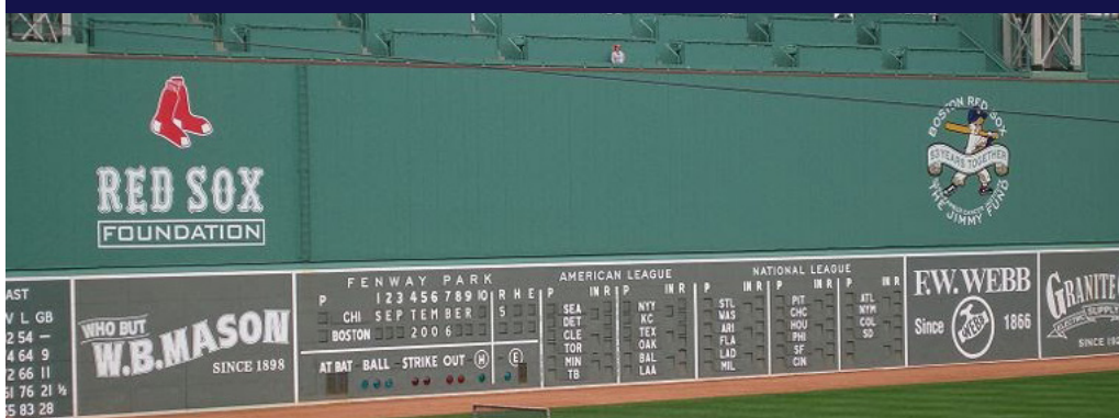
Final destination: Fenway Park and the Green Monster