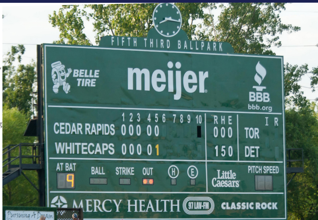
The West Michigan Whitecaps introduced their old fashioned manual scoreboard in 2012.

The scoreboard keeper also keeps track of all Detroit Tigers games being played at the same time, and posts the score and inning as each game goes on. That's a nice touch, since the