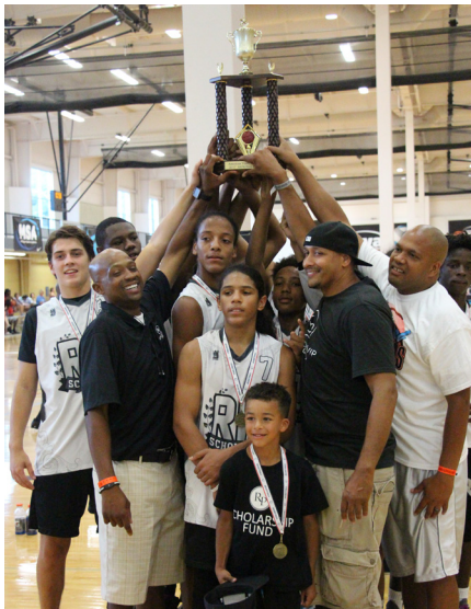
The RP Scholars celebrate their title at the recent AYBT tournament.

He plans to use $50,000 from the fund to establish an