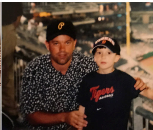
PNC Park, Pittsburgh, 2001