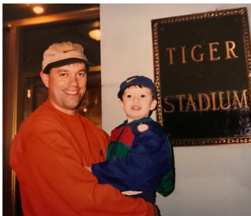
Tiger Stadium, 1999