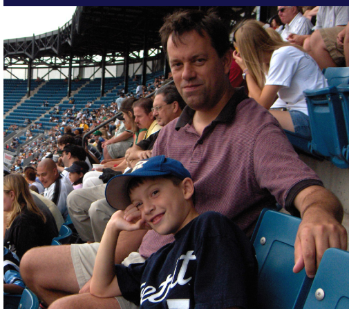
Cellular Field, Chicago, 2004