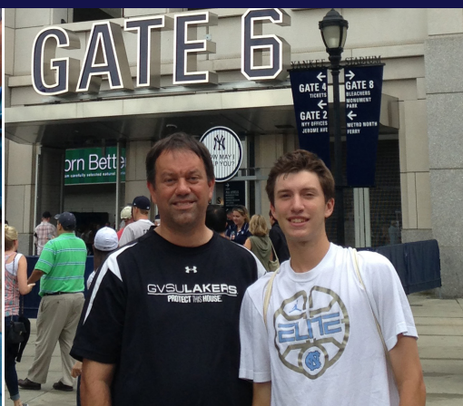
Yankee Stadium, 2013